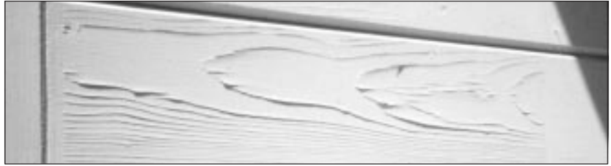
Fig. 2. Grain separation on the pith side of flat grain lumber

or “heart” face of the board (Figure 2). To prevent grain raising problems, the most important consideration is to orient boards so that the bark side will be exposed to the weather. Deck boards should always be installed “bark-side-up” and siding should be installed “bark-side-out” whenever possible.